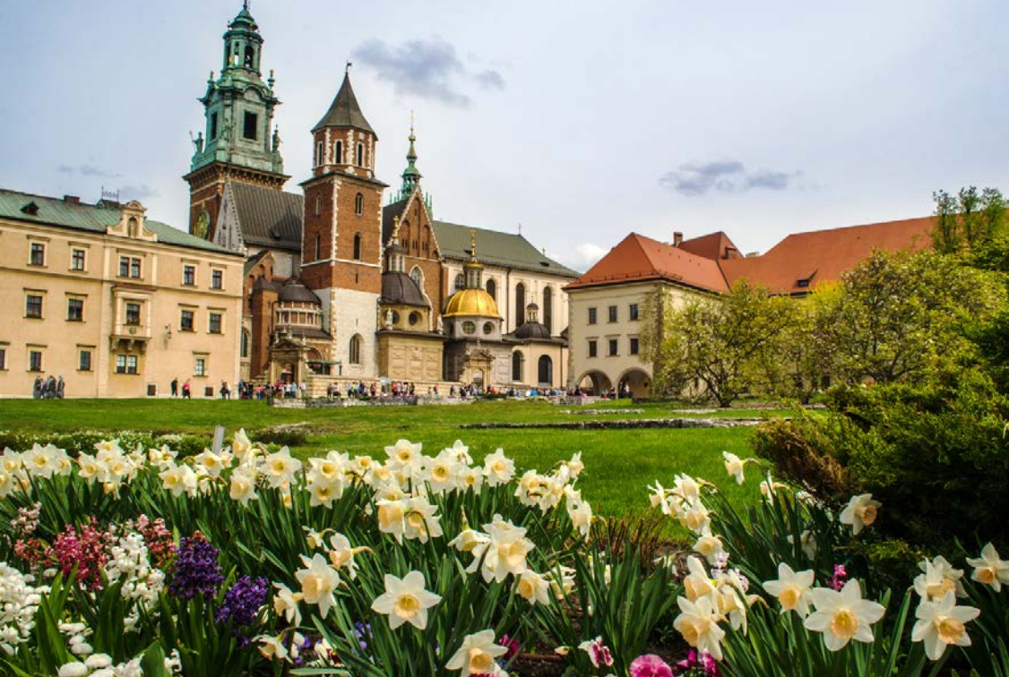
Wawel Castle and the Royal Cathedral - Krakow, POLAND