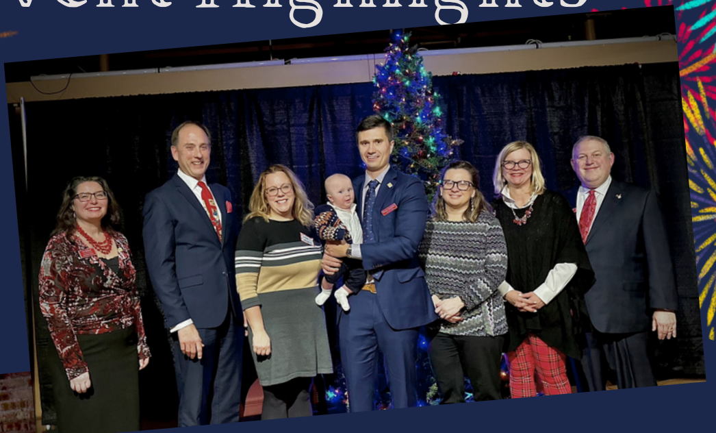
ADVOCATES' ANNUAL HOLIDAY PARTY